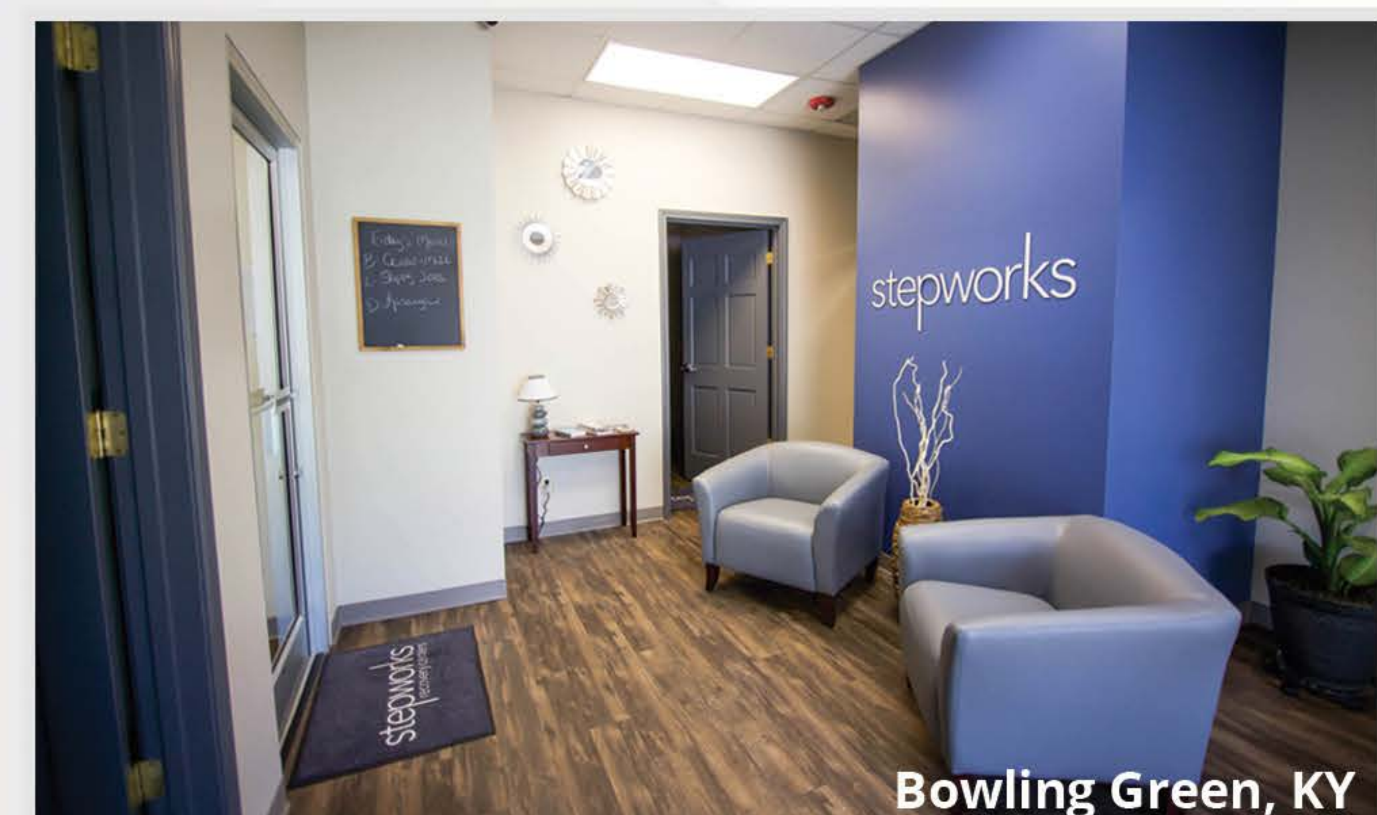
Bowling Green, KY